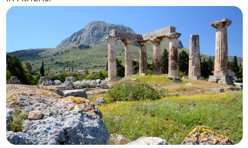
Day 9 - Tuesday, October 15: Delphi, Athens

the Agora, the ancient center of the economic and public life of the city, where Paul preached to the skeptical Athenians. During the bus tour, we also see Constitution Square with the House of Parliament and the Tomb of the Unknown Soldier, the Temple of Zeus, the Old Olympic Stadium, and the Neoclassical Buildings of Athens. The afternoon is at leisure to explore Athens on your own. In Athens, an Optional Wine Tasting (approximately $45 per person) will be offered for those who would like to. Dinner and overnight are in Athens.