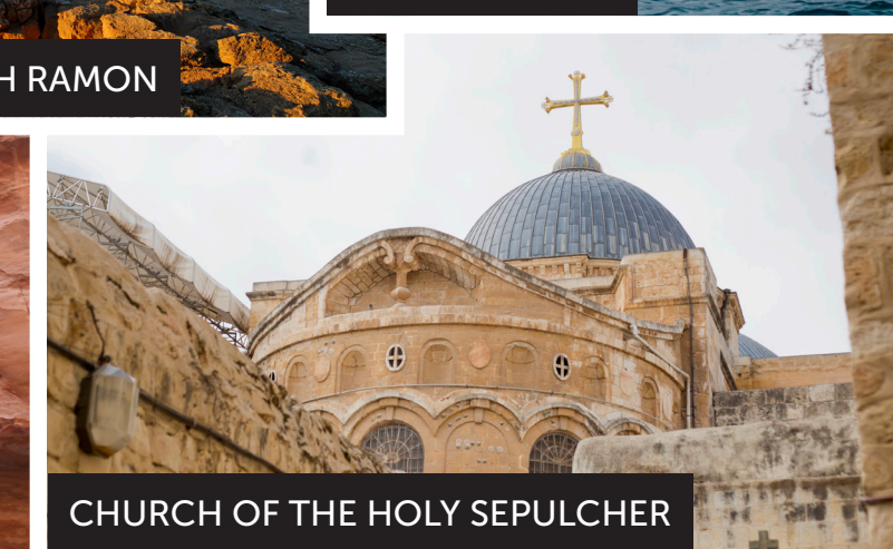
CHURCH OF THE HOLY SEPULCHER