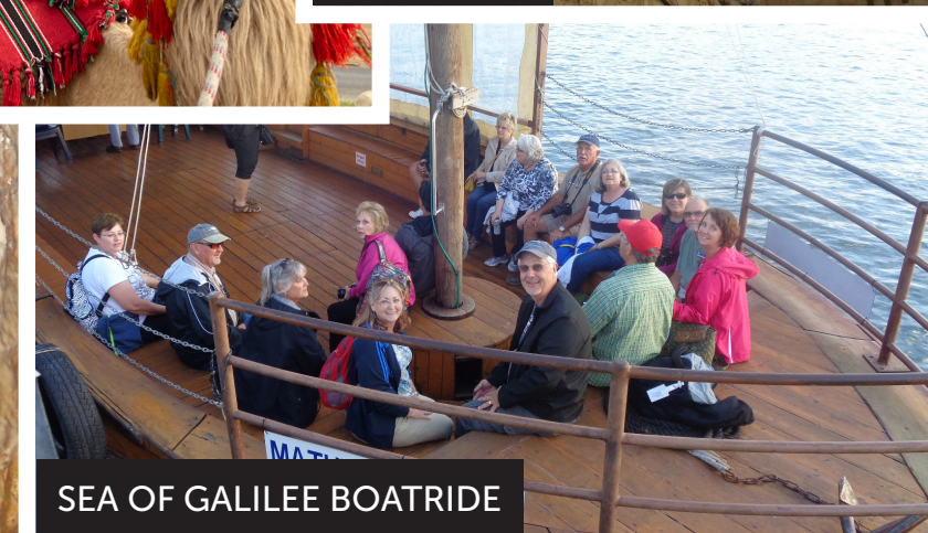
SEA OF GALILEE BOATRIDE